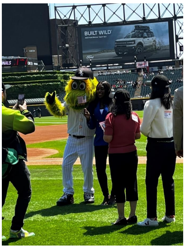
Above photos are courtesy of USCIS.